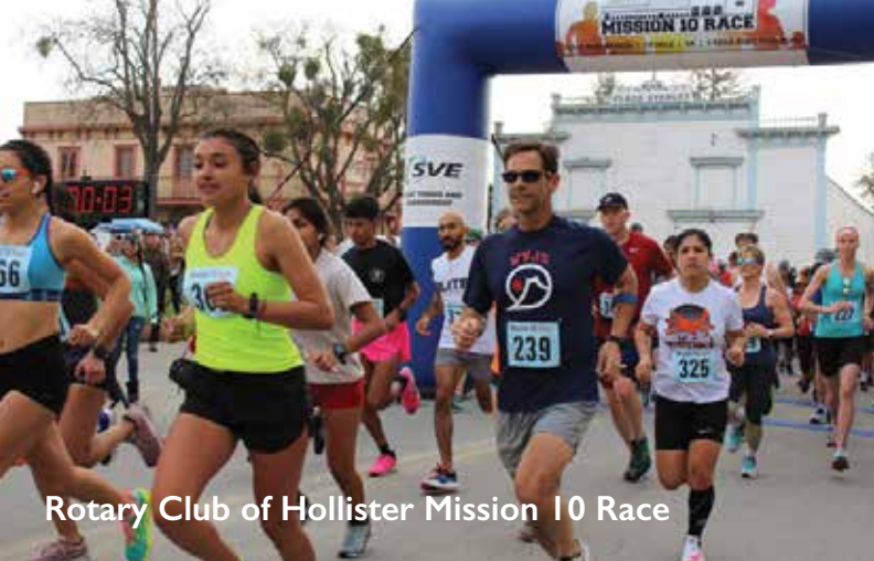
Rotary Club of Hollister Mission 10 Race