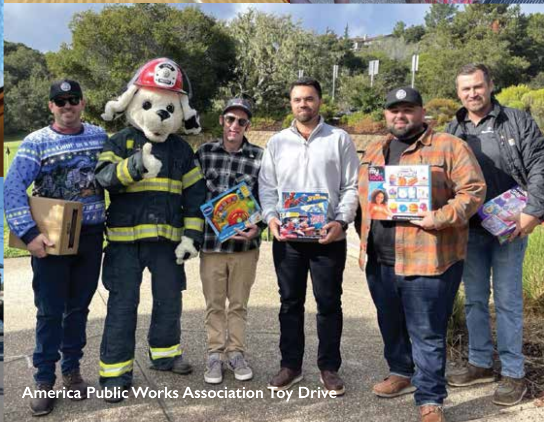
America Public Works Association Toy Drive