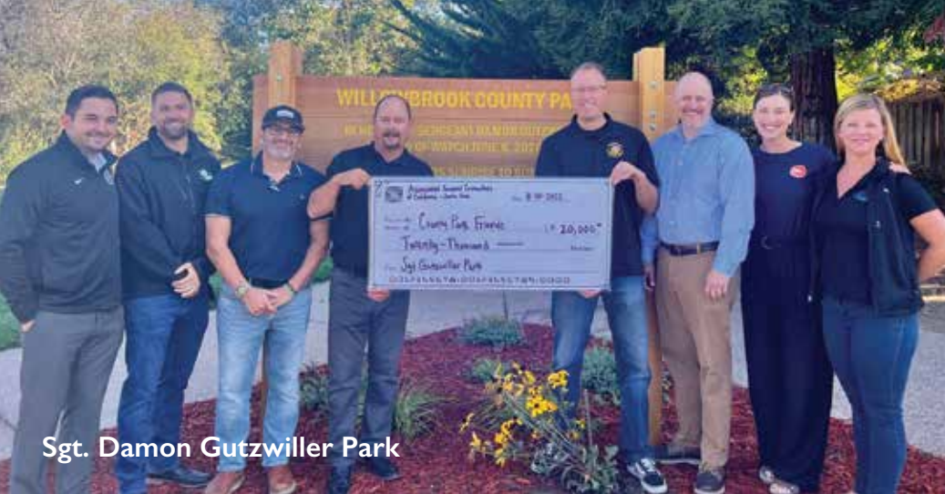
Sgt. Damon Gutzwiller Park