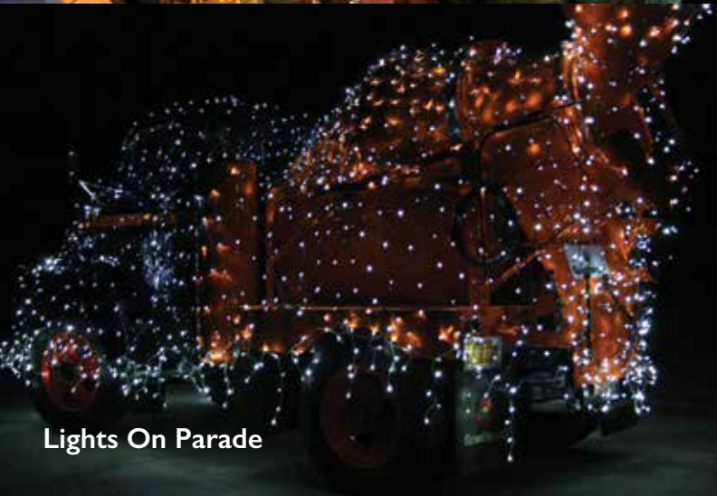
Lights On Parade