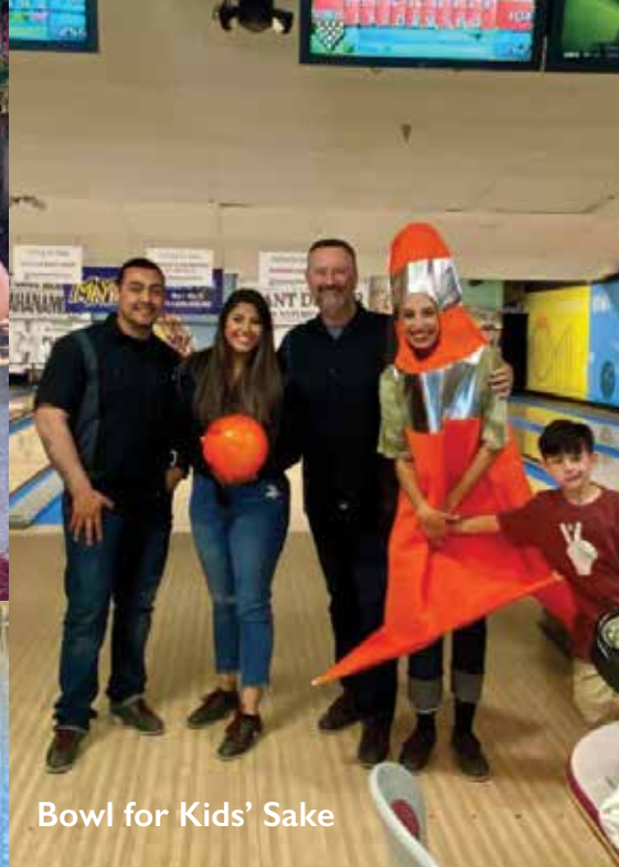
Bowl for Kids' Sake