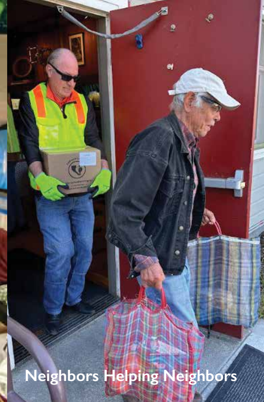
Neighbors Helping Neighbors