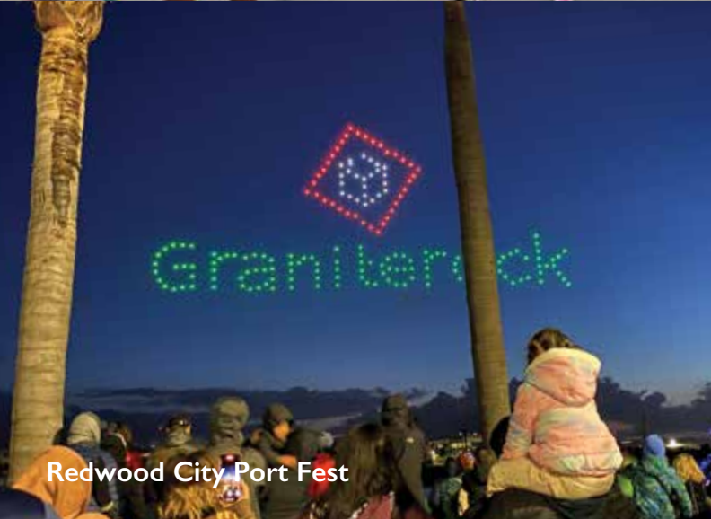
Redwood City Port Fest