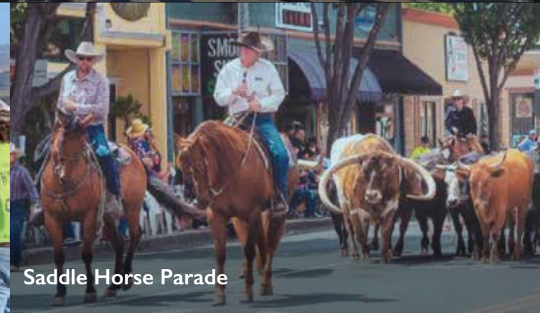
Saddle Horse Parade