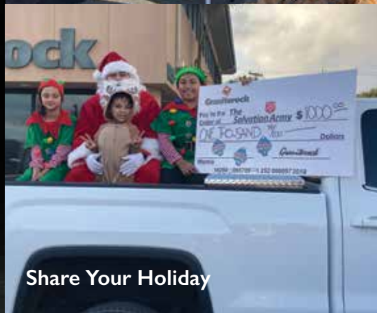
Share Your Holiday