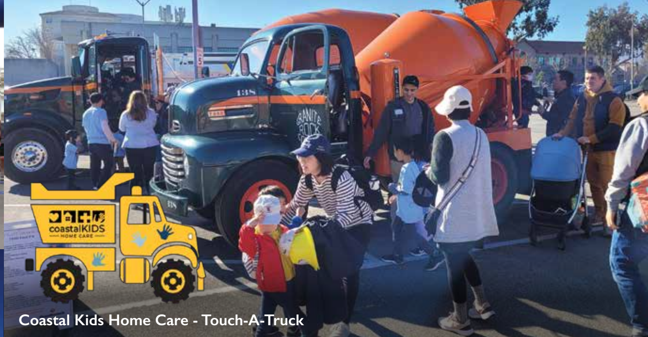
Coastal Kids Home Care - Touch-A-Truck