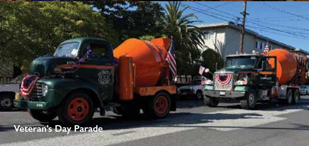
Veteran's Day Parade